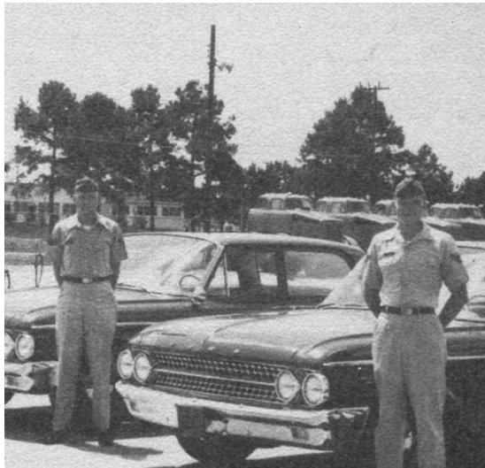
Operating wrecker crane