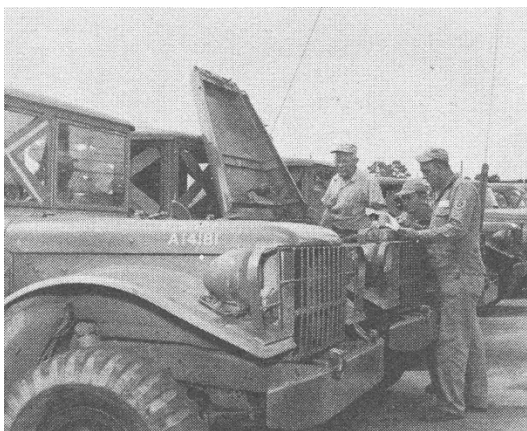
Any pilots want a ride to the ramp?