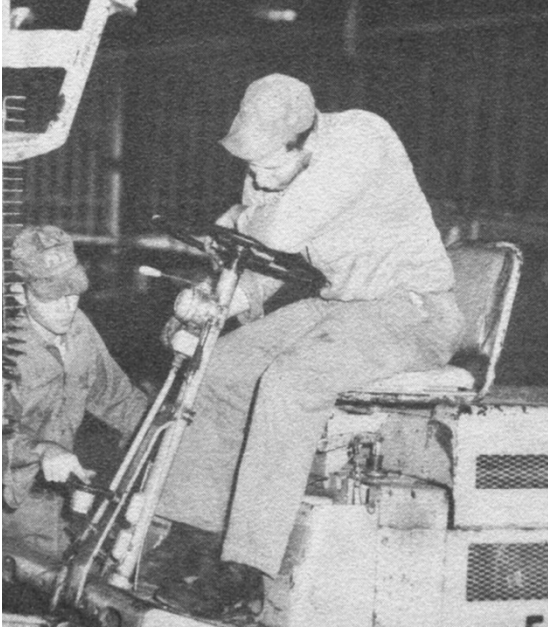
Repairing forklift